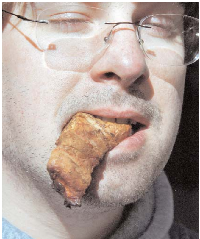
Chew, you worthless bastard.