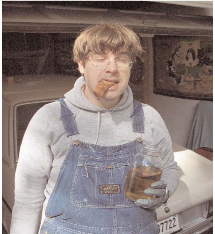
Hitting the wall: "Must go.....to U-Pull"

This article has been brought to you by the fine folks at the Senior Six Registry // www.seniorsix.org