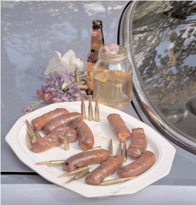
Pork Sample A: The trap has been laid.

We arrayed the first plate of barbequed pork sausages in such a manner as to arouse his primordial lust for the magical animal. Pulse rate quickened and pupil movement became rapid and uncontrollable.