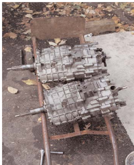
Luscious Tasty Treats: A delight to behold